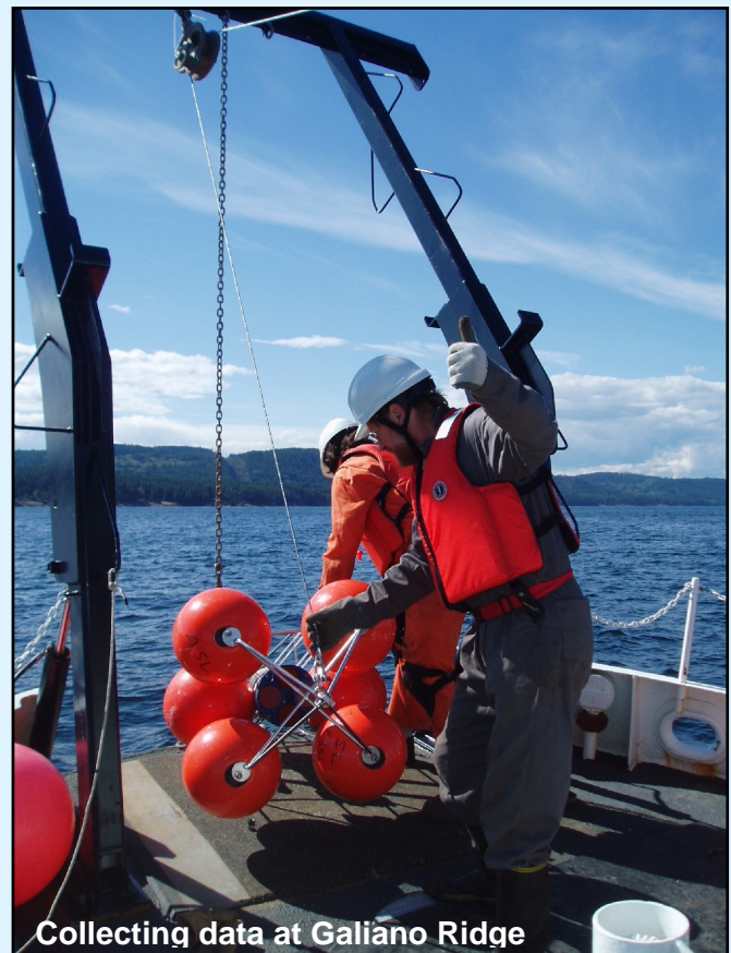
Collecting data at Galiano Ridge

ASL has compiled and analysed historical wind and wave data sets and conducted a very high resolution wave model study of Victoria Harbour in the area of the Fisherman's Wharf facility for the Greater Victoria Harbour Authority.