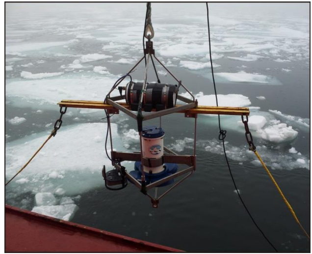
Figure 2. AZFP - ADCP instrument package.